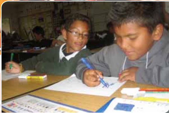
Students drawing pictures about what Dvorak's New World Symphony means to them at Opus Camp