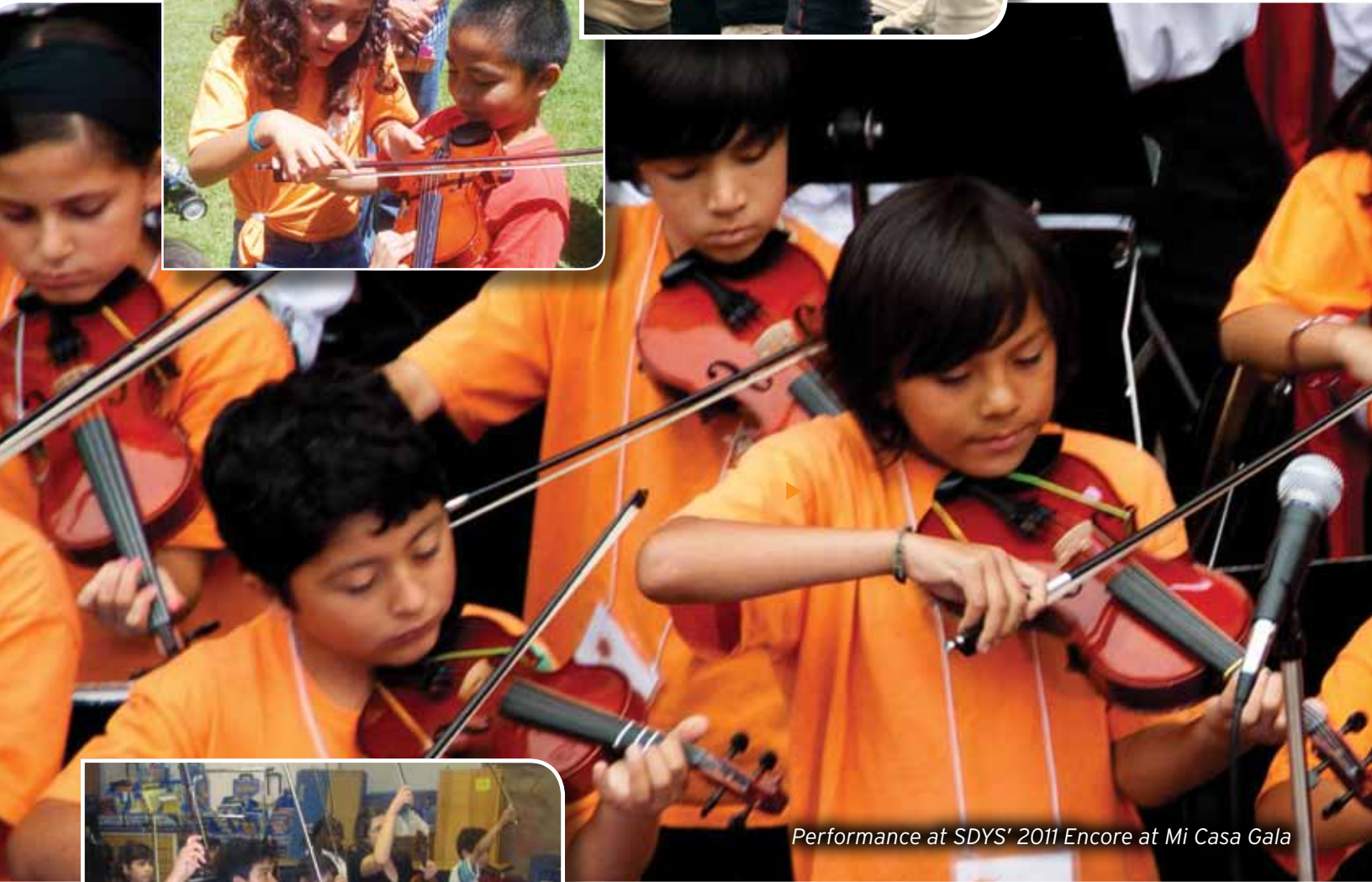
Performance at SDYS' 2011 Encore at Mi Casa Gala

"The children stand taller now that are in Opus. They are so proud of themselves and know that they can do anything in life." – Opus Instructor